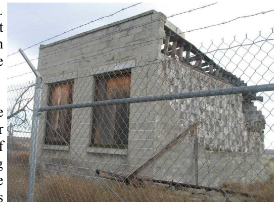
The White Bluffs bank has seen better days